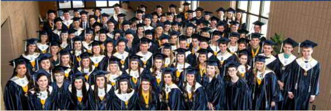
The Class of 2016 celebrates the school's 62nd commencement.