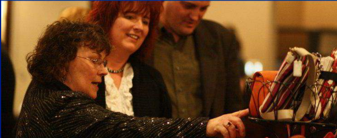
PHS supporters inspect silent auction items at a past Gala Dinner & Auction event