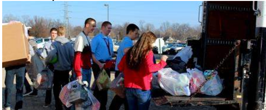
PHS students loading 1,820 toys on the Salvation Army truck.

Providence students worked in various ways to help others enjoy their Christmas holiday. The students met their goal of collecting for Toys for Tots in December with a total of 1,820 toys donated to the Salvation Army. As a reward, students were allowed to wear spirit wear the last two days of finals. But the real winners were the many children who were able to receive a toy for Christmas.