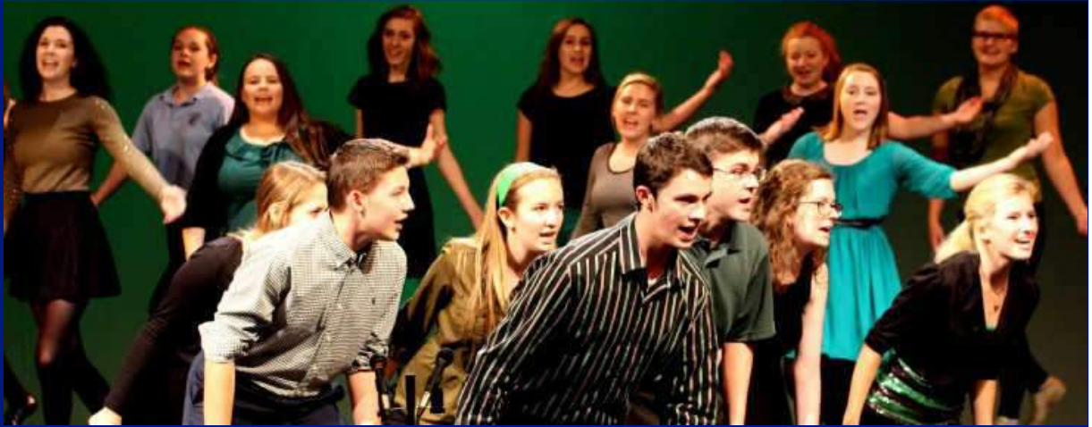
The Providence Singers performing at the Fall Concert last Sunday.