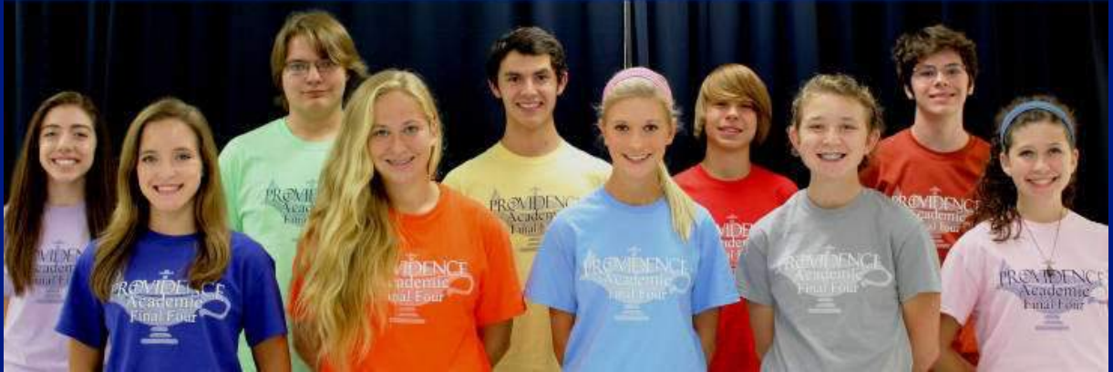
These 10 students represent more than 145 students who received Academic Final Four T-shirts in recognition of their outstanding achievement in the 2013-2014 school year.