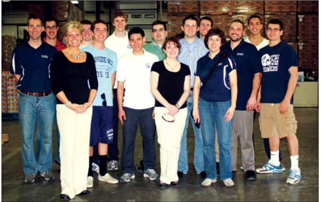
The Alumni Association and student leaders join together to volunteer at Dare to Care Food Bank.