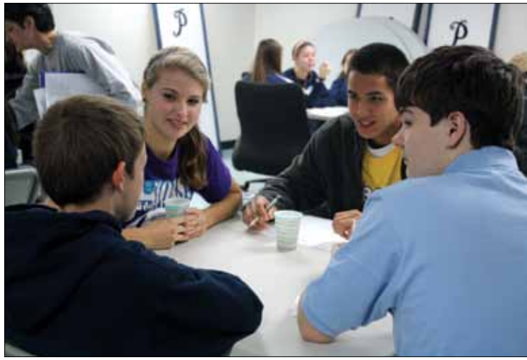
Providence launches the Peer Coach Program.