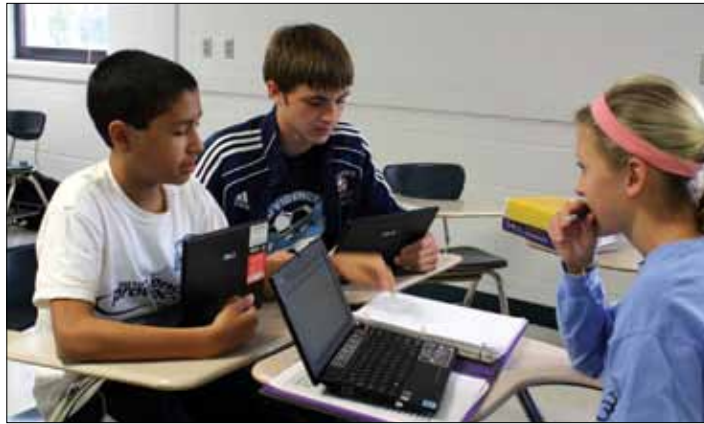
English students test mobile netbooks.