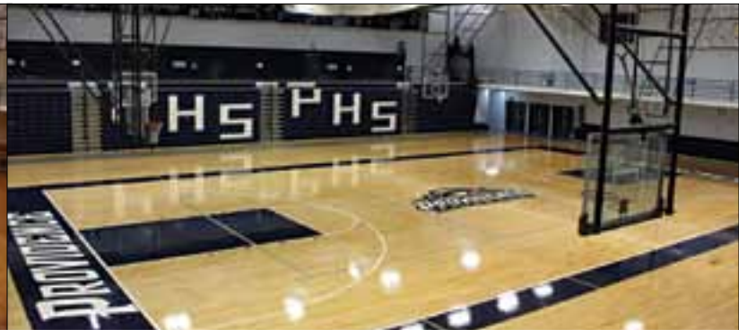
The Larkin Center, summer 2014, after new bleachers were installed and the floor repainted, featuring the refreshed athletic logo.